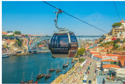
Fig. 1. Transparent and Enclosed Aerial Funicular

(Abelle, 2022). In addition, although Swiss designer Fredrik Hylten has designed a solar cable car, its fully open C-shaped design has a 360-degree view and the ropeway passenger traffic is highly adaptable to the environment, the factors of strong wind, rain, snow and especially safety are still taken into account. Therefore, the structure of the aerial funicular we propose is still the first choice for traditional enclosed cabins and transparent to facilitate viewing the surrounding scenery (Fig. 1).