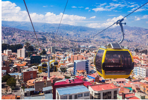
Fig. 2. Aerial Funicular with Tower Supporting

In general, the operation mechanism of the aerial funicular is to use a pole less wire rope, which is set on the driving wheel and roundabout wheel at both ends of the cableway and maintain a certain tension through the tensioning device. In general, the driving wheel drives the wire rope at a speed of 6.0 m/s (Težak et al. , 2016). The operation of the aerial funicular is a huge technical project in which every mechanical part plays an important role. According to the different operation and construction, it can usually be divided into reciprocating and circulating ropeways. Thus, according to the local specific travel data of residents, the design should consider assuming a two-lane round-trip aerial funicular for passengers or increase the passenger capacity of the cabins. Besides, compared with the vast majority of traditional cabins, we recommend that a mature solar power storage system be loaded into the cabin body to be driven by more natural and clean energy. Solar cabins are nothing new, but it is the first time this concept has been used to address