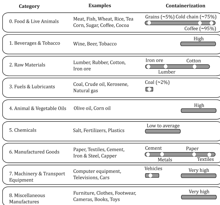
Fig. 2. Commodity Group and Containerization Level Source: adapted from (Rodrigue, 2017)

as grain, chemicals, wood products, as well as temperature-sensitive products, such as food, represent a niche for containerization. In chapter three, some challenges in further containerization of stated commodities based on their logistics characteristics will be discussed in more detail.