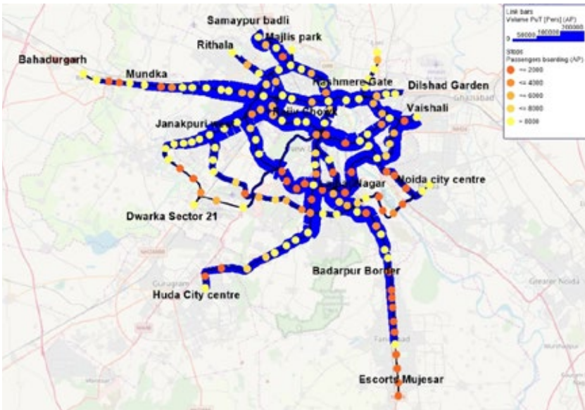
Fig. 3. Metro Trip Assignment for Current Scenario (2018)