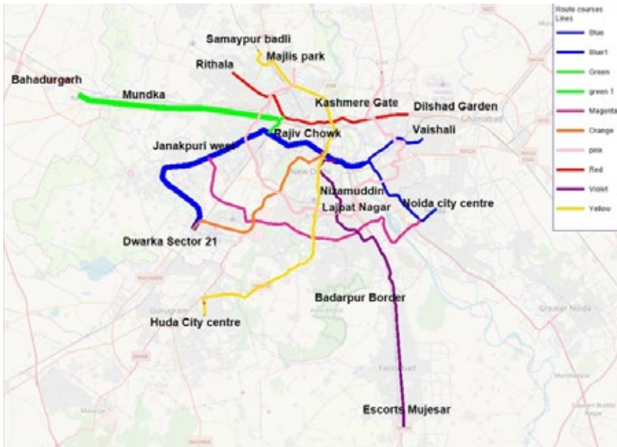
Fig. 1. Metro Network Lines Digested in VISUM (2018)