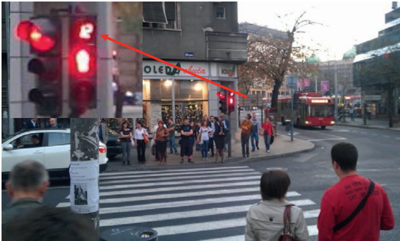
Fig. 1. The Researched Location of Pedestrian Crossing

per lane was over 1,500 vehicle/hour and pedestrian flow at pedestrian crossing was over 700 pedestrian/hour. Speed limit was 40 km/h. The cycle light lasted 80 seconds, and green light for pedestrians lasted “only” 10 seconds. This was main reason because we researched pedestrian crossing equipped with countdown display. While pedestrian flow was flowing over 700 pedestrians/hour and the green light for pedestrians was shorting, we wanted to research, how is behavior of pedestrians at signalized crossing equipped with countdown display.