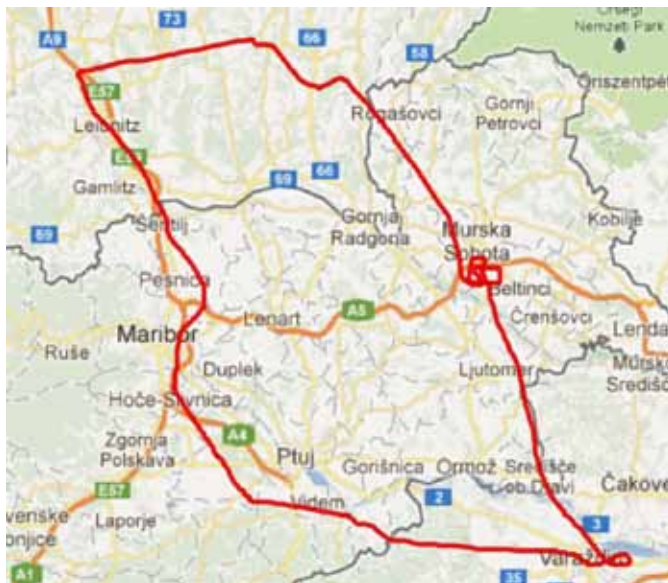
Fig. 5. An Example of Tracking Device Using the Android Mobile