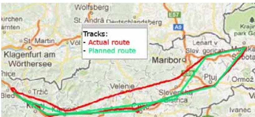
Fig. 7. Navigation Using the Mobile Device

The tests revealed a number of problems that need to be considered when implementing Android mobile navigation in practice. The biggest problem is downloading Google Maps within the cache memory, because there is need to connect to a wireless network. On the other hand, Google Maps are not real navigational charts, but general maps. This calls for a fixed loading of the correct navigational maps on Android, which are not free of charge. Another problem is the large power consumption of mobile devices. This problem was partially solved by turning off the mobile network after the map had already been stored on the mobile device. A complete solution to this problem would be to use airplane's electrical system as a power source, for which an appropriate adapter would be needed.