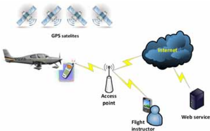
Fig. 3. The Concept of Mobile Navigation on Android

The tracking function serves light-airplane's instructors as a means of controlling their student pilots during independent flights. In the event that an airplane flies near an airport, where the wireless signal is usually strong enough, the movement of the airplane online can be displayed. This means that the instructor at the airport monitors the student pilot using a virtual navigation map with a web-browser in real-time. The event that