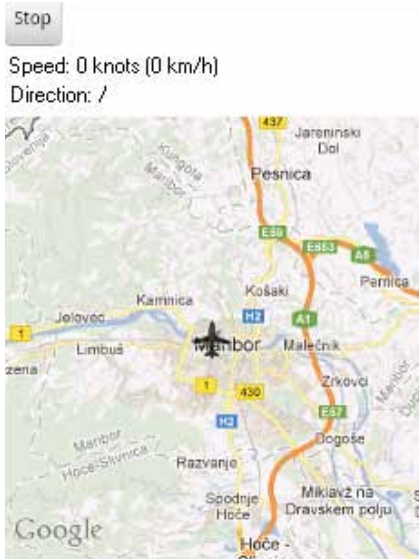
Fig. 4. Tracking on the Android Mobile Device