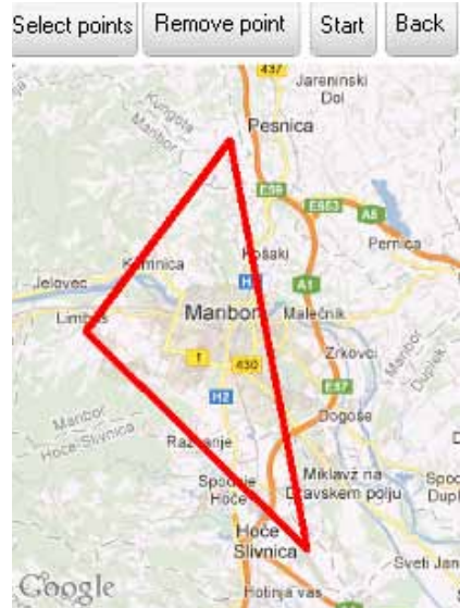
Fig. 6. Creating the Flight Plan on the Mobile Device